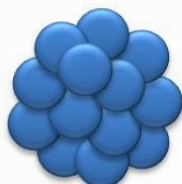
Regular water cluster (15-20 molecules)