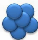
Ionized water cluster (4-6 water molecules)