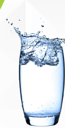
GLASS OF IONIZED WATER