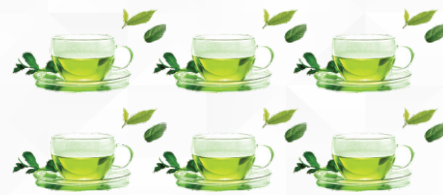
CUPS OF GREEN TEA